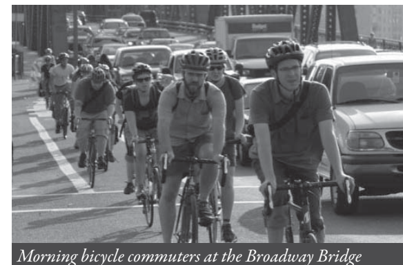
Morning bicycle commuters at the Broadway Bridge