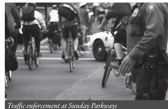
Traffic enforcement at Sunday Parkways