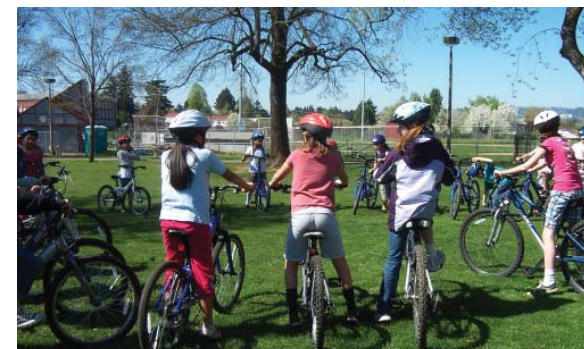
Young bicyclists in the park

Portland's thriving economy derives from its fit and healthy employee base. Every business encourages employees and visitors to bicycle and offers high quality, plentiful bicycle parking. With more money in their pockets and circulating in the local economy due to