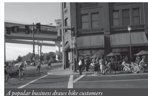
A popular business draws bike customers

4.2 D. Implement enforcement practices that contribute to the safety and attractiveness of bicycling.