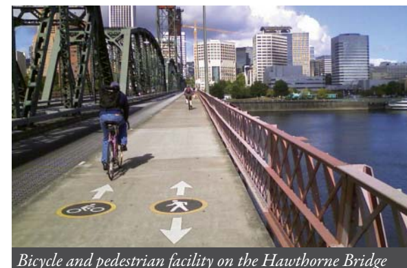
Bicycle and pedestrian facility on the Hawthorne Bridge